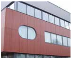
Project, mounting and more